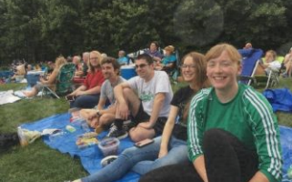
At Blossom Music Center

Website: http://www.csuohio.edu/sciences/physics/soft-matter-reu