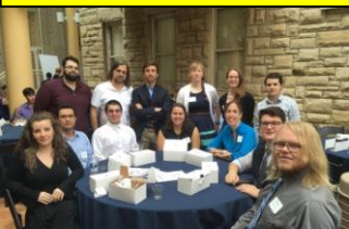
14 th Annual Northeast Ohio Undergraduate Research Symposium (CWRU; Aug 3, '17)

Program Dates: June – August 2021 (10 weeks)